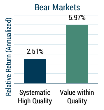
April 1928 – December 2024 | Source: GMO Bear market is the drop in prices of at least 20% from any peak over a period of at least 3 months. GMO Quality is the highest quality 1/3 of the U.S. market. Value within Quality is the low valuation half of that, relative to the broader U.S. market.